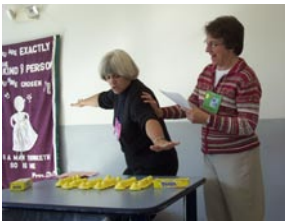
Sorting Peeps skit illustrated God's unconditional love

One banner in the room said, "Lies are weeds in the garden of your mind." Massive doses of weed killer are required at times. Scripture truth is what's needed in our minds to kill the weeds of lies.