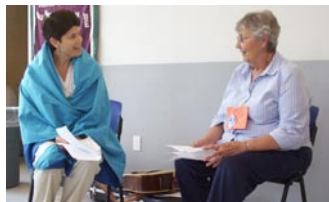
"Peter" shares his experience of walking on the water (and sinking)

In the unfairness of life and the hard things we go through, we can get stuck in our thinking. God will help us get unstuck and His truths from Scripture truly are life-giving.