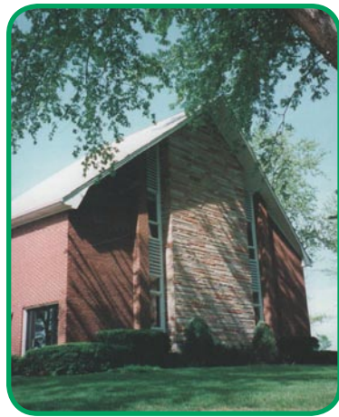
Clarence Center-Akron Mennonite Church

“ I will build my church (Matthew 16:18): Equipping and inspiring congregations for growth ” is the theme of this year’s seminar. Do you know what percentage of Mennonite Churches membership are new believers? How do Mennonites’ marriage and divorce rates compare with the rest of the US population? Are our young people more or less engaged with the church than previous generations? Where do Mennonites go to find news about the world? Come find the answers to these questions, and more, and learn what the answers might mean for our conference and congregations.