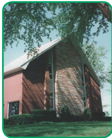
Clarence Center-Akron Mennonite Church

“I will build my church (Matthew 16:18): Equipping and inspiring congregations for growth” is the theme of this year’s seminar. Do you know what percentage of Mennonite Churches membership are new believers? How do Mennonites’ marriage and divorce rates compare with the rest of the US population? Are our young people more or less engaged with the church than previous generations? Where do Mennonites go to find news about the world? Come find the answers to these questions, and more, and learn what the answers might mean for our conference and congregations.