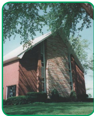
Clarence Center-Akron Mennonite Church

“I will build my church (Matthew 16:18): Equipping and inspiring congregations for growth” is the theme of this year’s seminar. Do you know what percentage of Mennonite Churches membership are new believers? How do Mennonites’ marriage and divorce rates compare with the rest of the US population? Are our young people more or less engaged with the church than previous generations? Where do Mennonites go to find news about the world? Come find the answers to these questions, and more, and learn what the answers might mean for our conference and congregations.